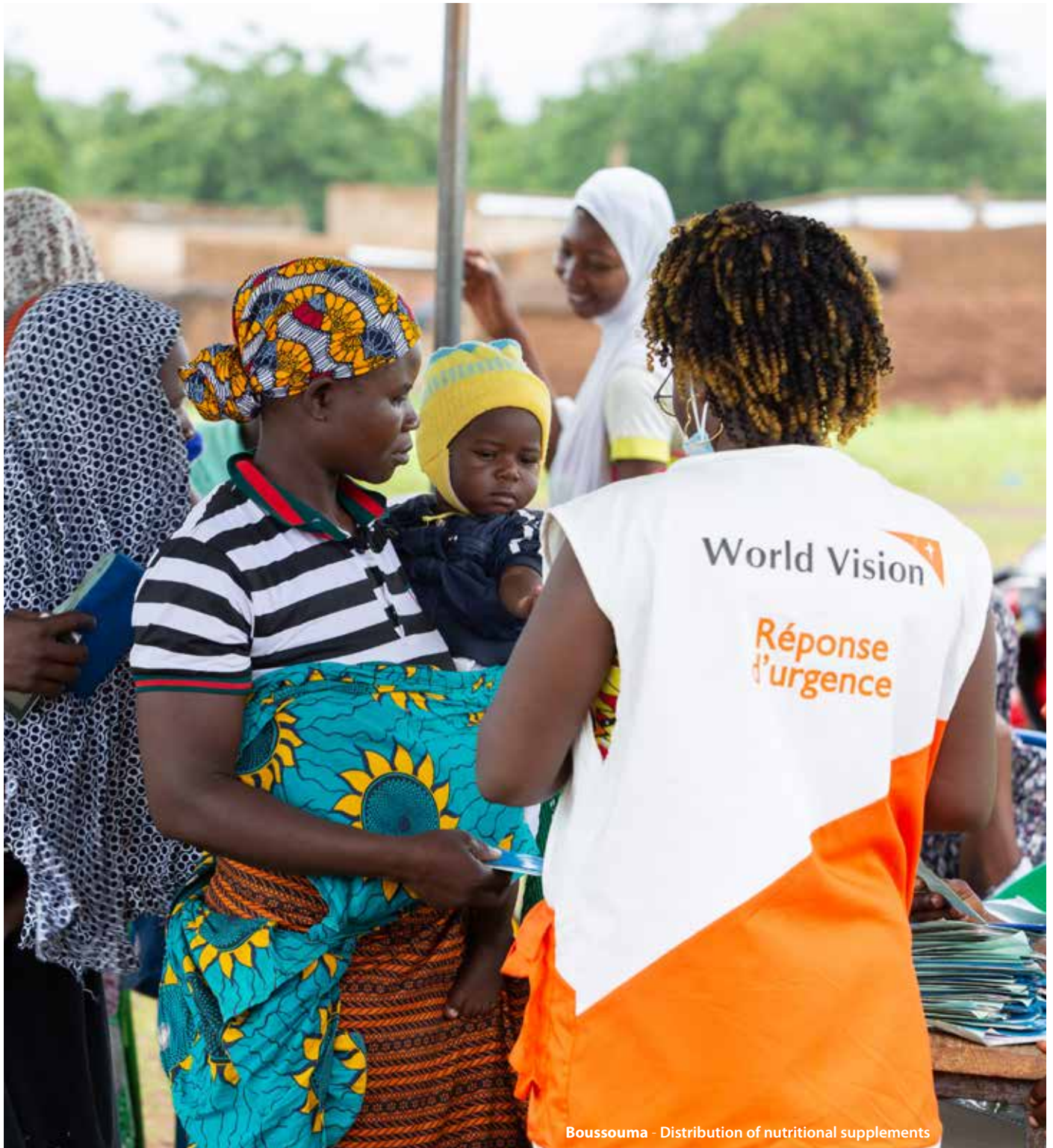
Boussouma - Distribution of nutritional supplements

75,593 adults including 28,525 men and 47,067 women