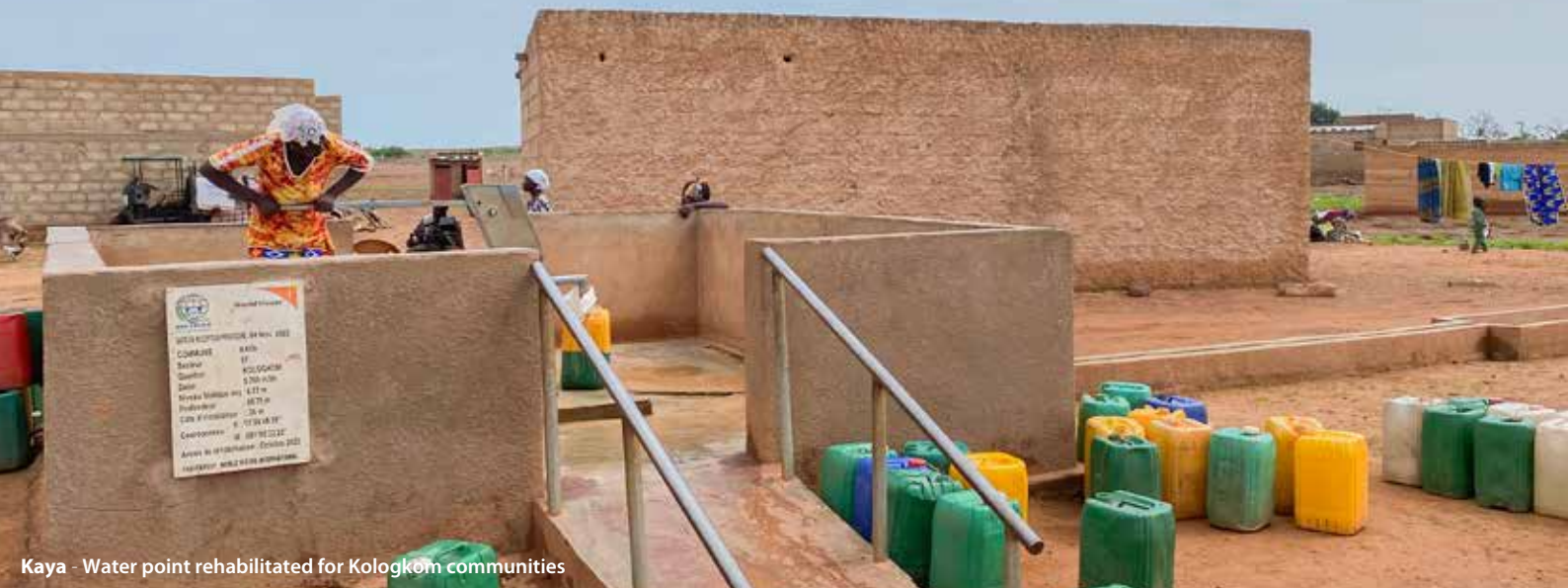
Kaya - Water point rehabilitated for Kologkom communities