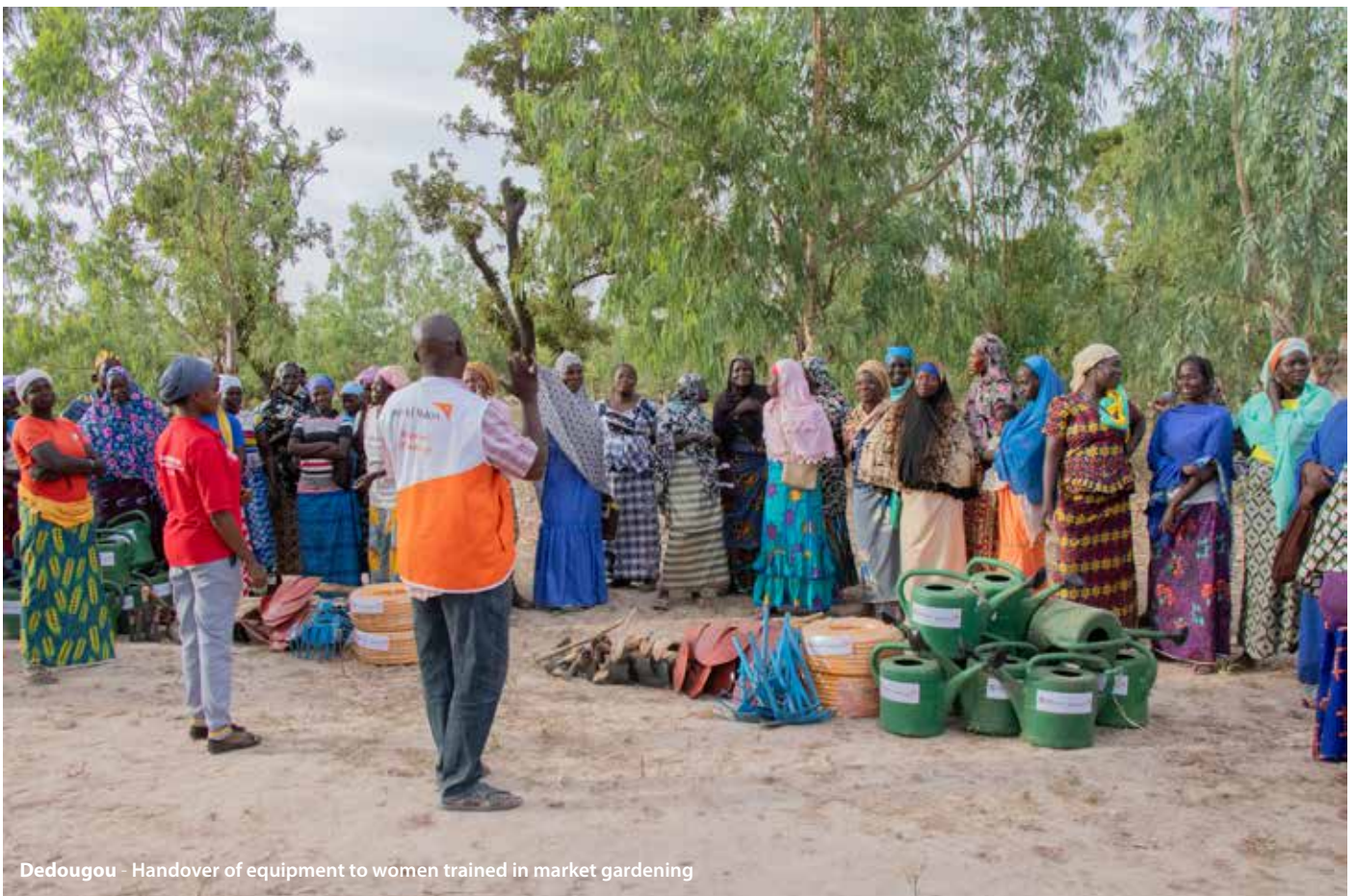
Dedougou - Handover of equipment to women trained in market gardening