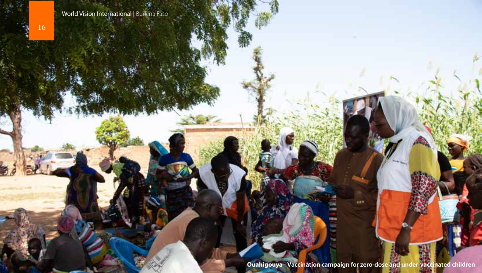
Ouahigouya - Vaccination campaign for zero-dose and under-vaccinated children