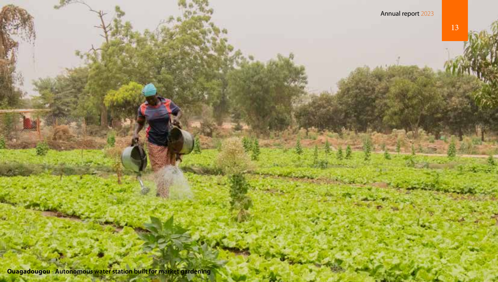
Ouagadougou - Autonomous water station built for market gardening