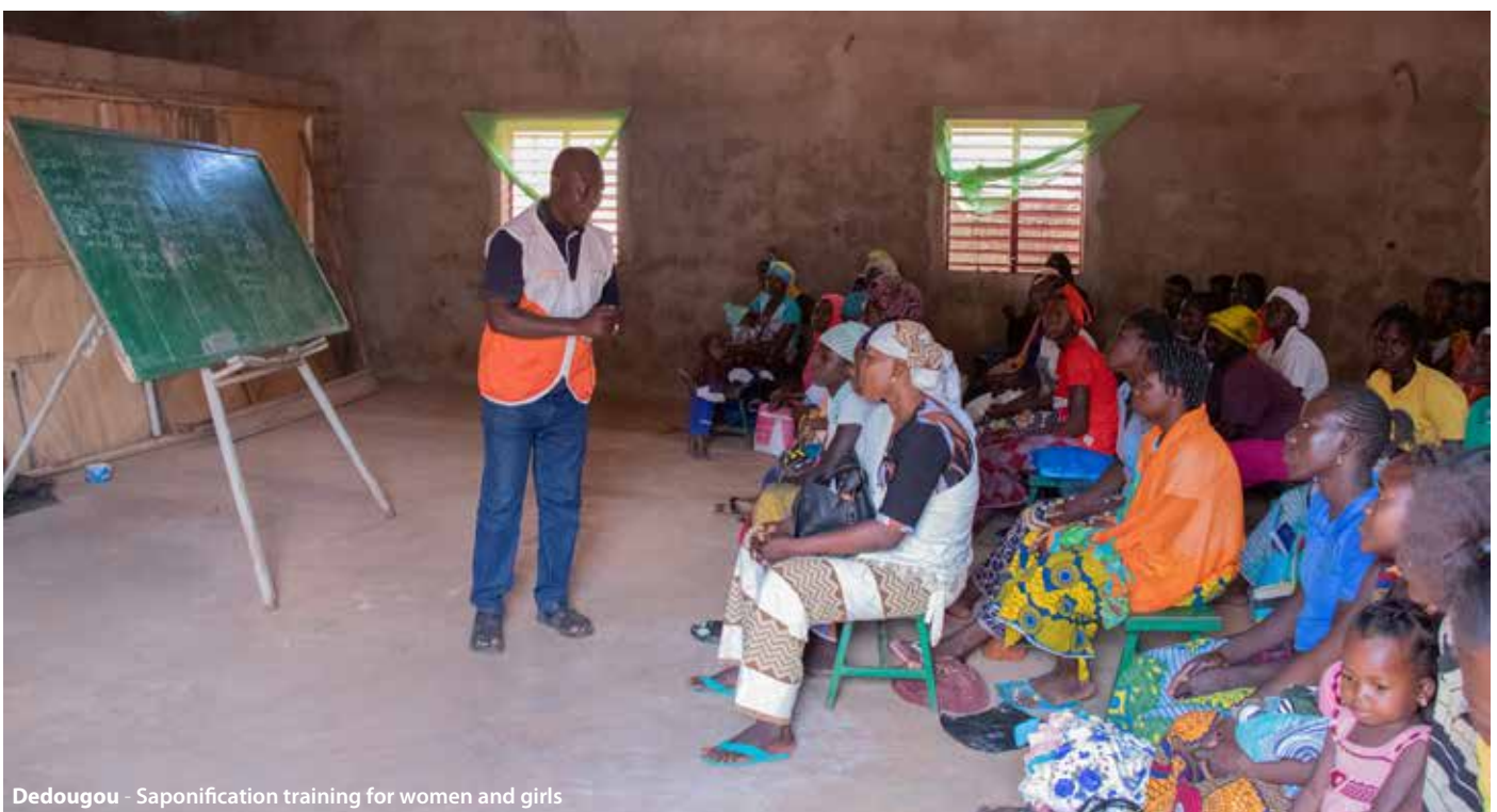
Dedougou - Saponification training for women and girls